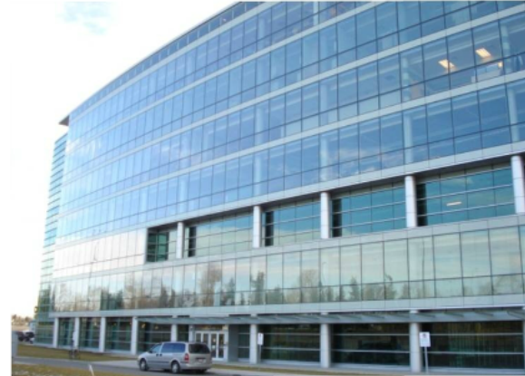
Research and Innovation Centre