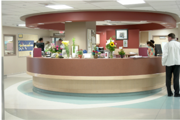
Medical Teaching Unit 36